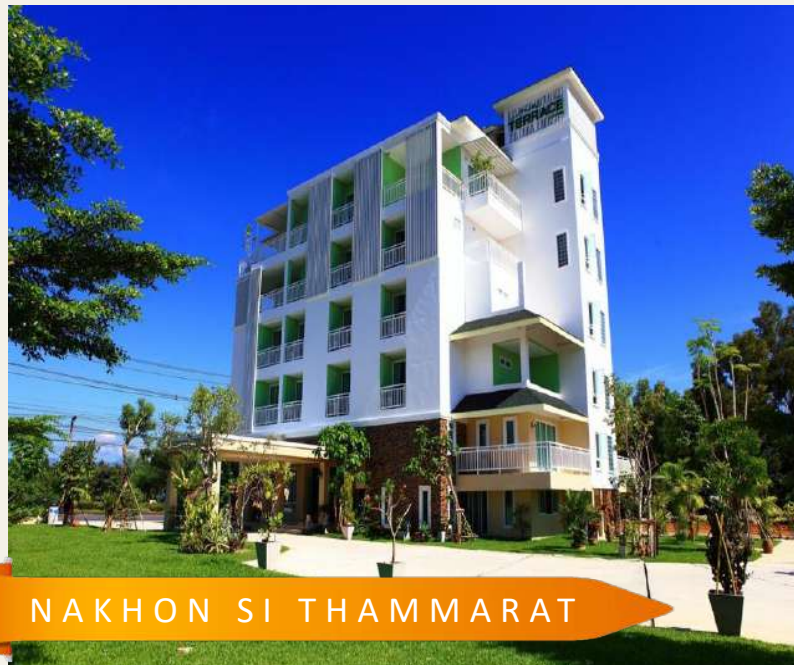
NAKHON SI THAMMARAT